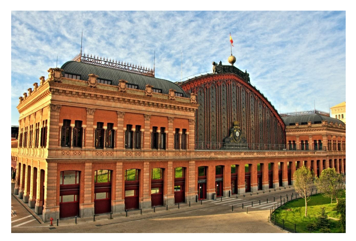
Atocha Train Station (Madrid)

If your flight is from Madrid, you can go to Huelva by train from the train station called Atocha. You can check their timetables in the following link: <u>http://www.renfe.es/</u>