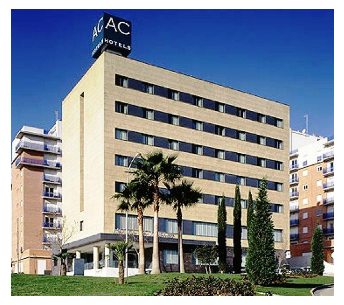
AC Hotel by Marriott Huelva

For short-term accommodation, hotels are the best option. "AC Hotel by Marriott Huelva" is the closest to the campus.