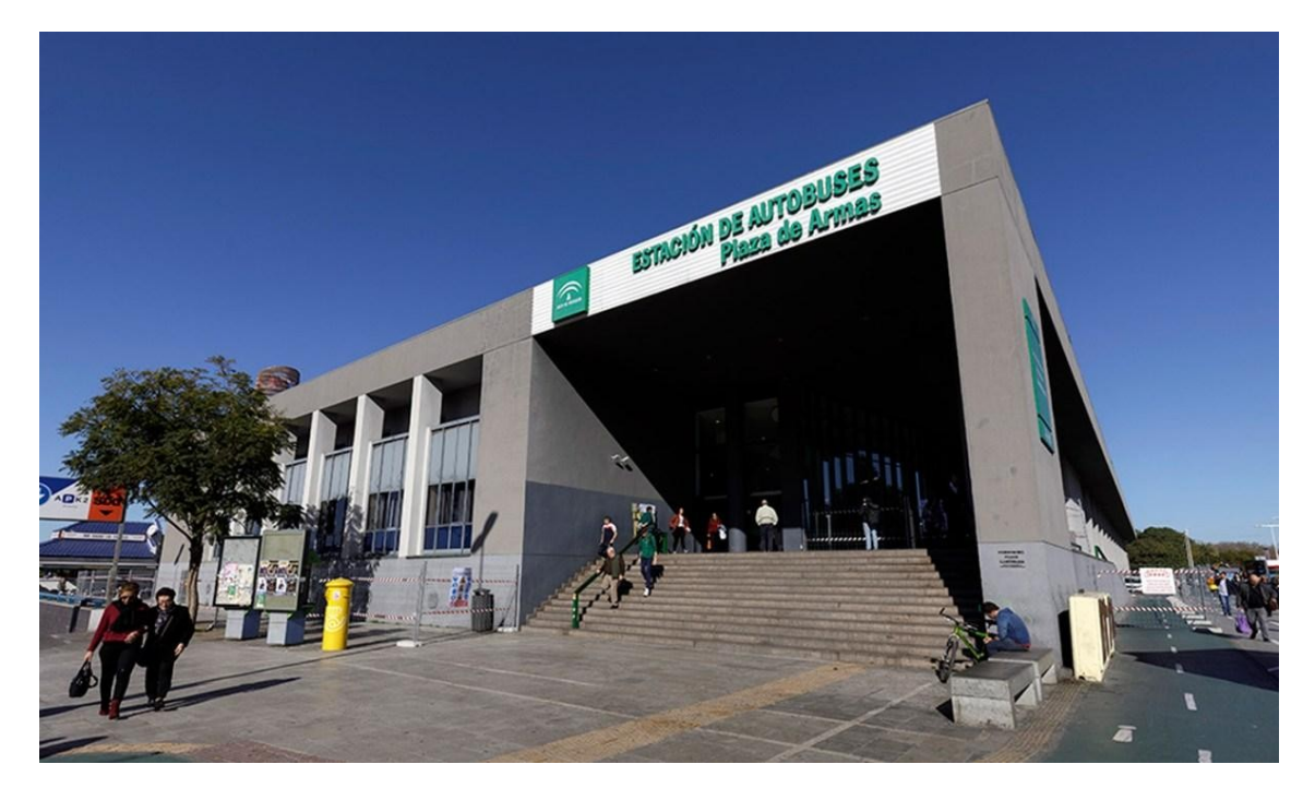
Plaza de Armas Bus Station (Seville)

If you fly from Seville you can take a taxi/bus to 'Plaza de Armas Bus Station'. There are two bus stations in Seville but the Plaza de Armas is the only one that serves Huelva. If you do not want to go by taxi, you can take the bus from the airport to the city centre (Airport Special Line, which costs 4 \in ). The bus stops in the train station (Santa Justa) where you can get by train to Huelva and you can also take an urban bus called C4, to go to the 'Plaza de Armas Bus Station'.