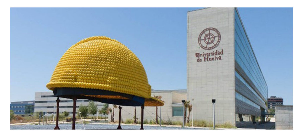
University of Huelva, Campus el Carmen